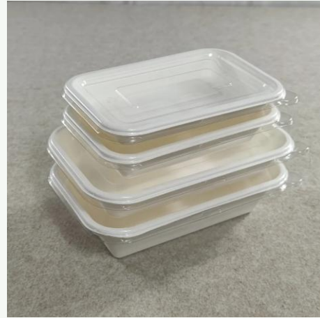
PET Flat Lid