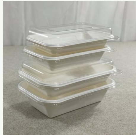
PET Dome Lid