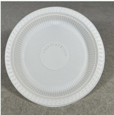
Cornstarch Plate 10 Inch