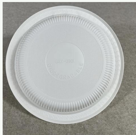
Cornstarch Plate 9 Inch