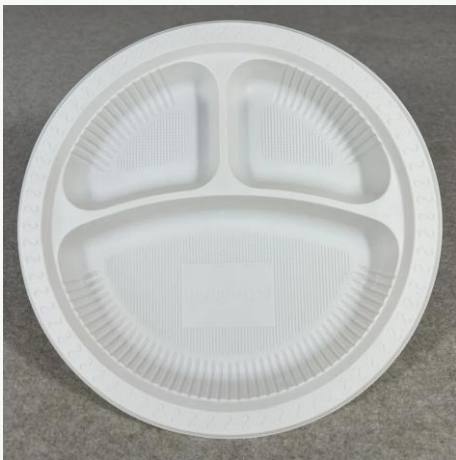
Cornstarch Plate 10 Inch 3-C