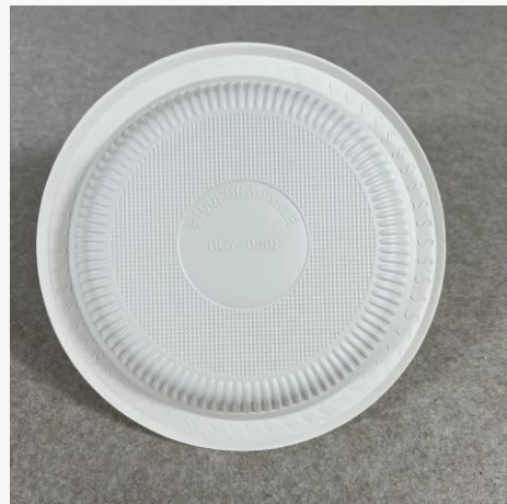
Cornstarch Plate 8 Inch