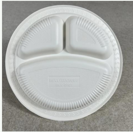
Cornstarch Plate 9 Inch 3-C