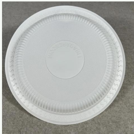
Cornstarch Plate 10 Inch