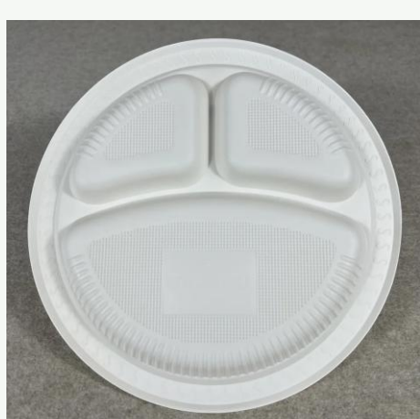
Cornstarch Plate 10 Inch 3-C