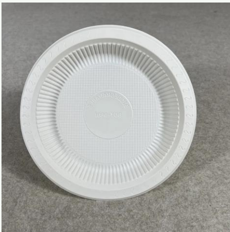
Cornstarch Plate 8 Inch