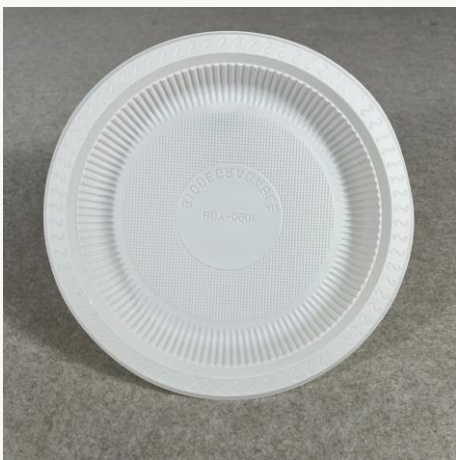
Cornstarch Plate 9 Inch