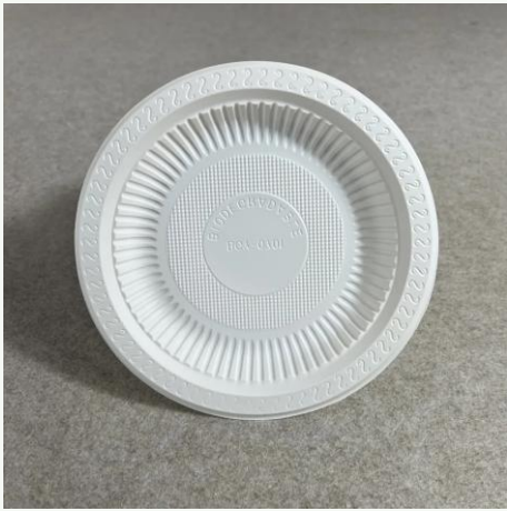
Cornstarch Plate 7 Inch