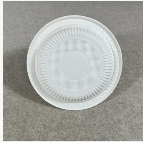
Cornstarch Plate 7 Inch