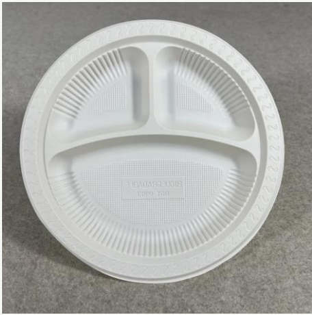
Cornstarch Plate 9 Inch 3-C